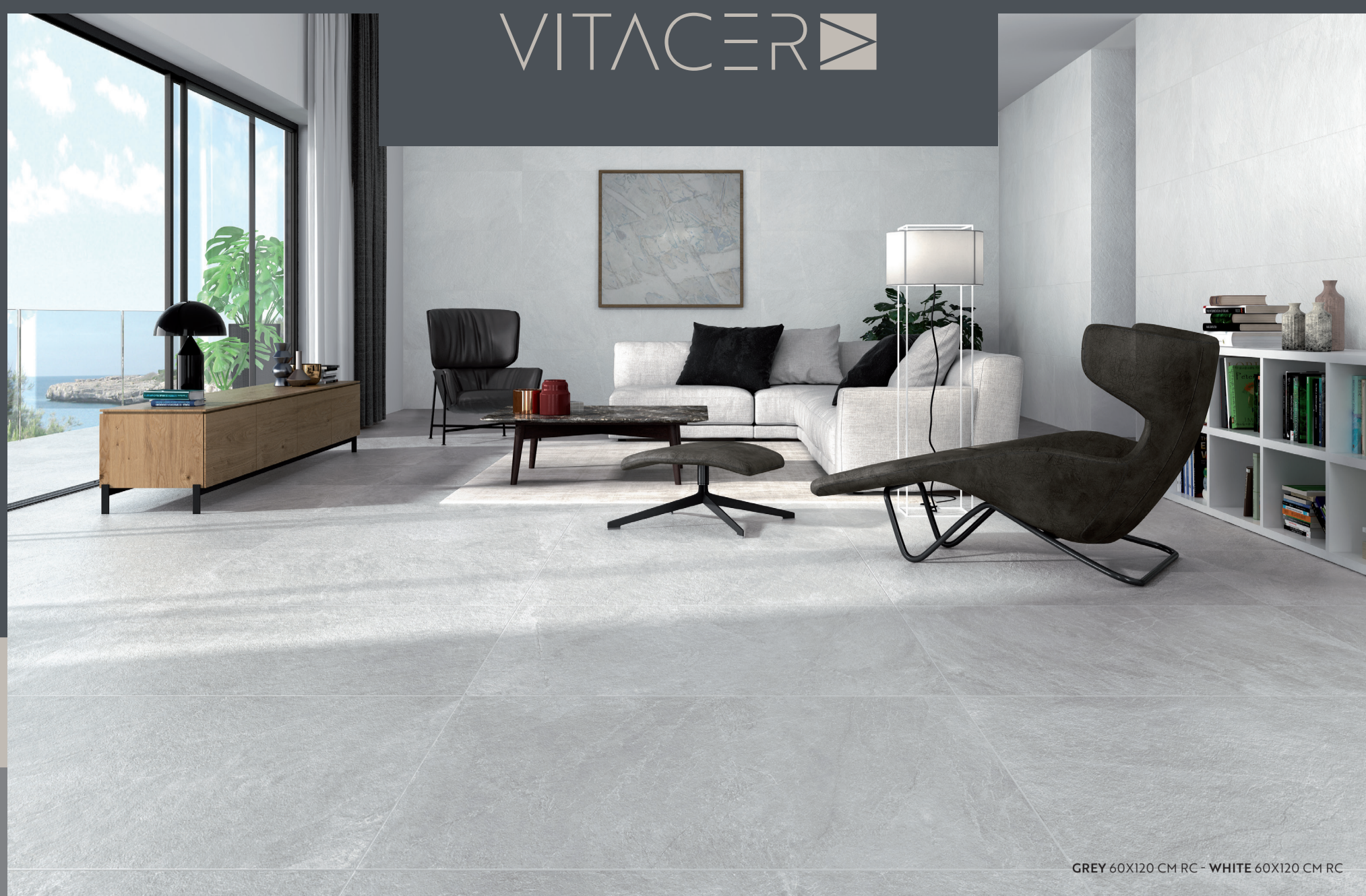
GREY 60X120 CM RC - WHITE 60X120 CM RC