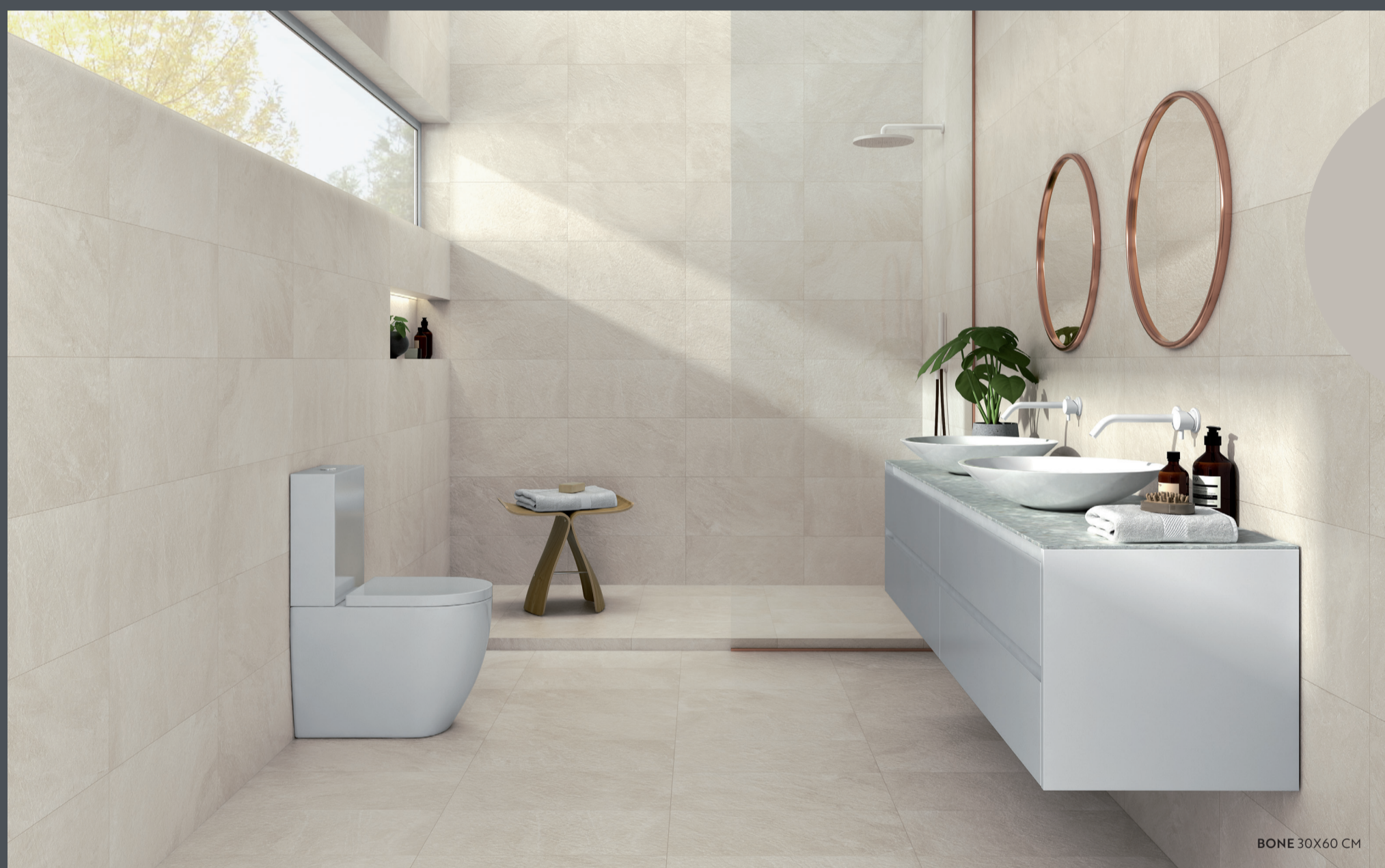
BONE 30X60 CM